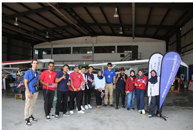
Discovery Flying During Merdeka

23 rd June 2022 engagement with the Klang District Youth, Sports Office (PBSO) and the Klang District Selangor State Youth Council celebrating the Klang District National Youth Day 2022.