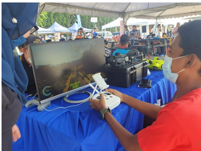
National Youth Day Klang 2022

23 rd June 2022 engagement with the Klang District Youth, Sports Office (PBSO) and the Klang District Selangor State Youth Council celebrating the Klang District National Youth Day 2022.