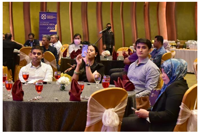
CILT Malaysia Hi-Tea & Networking Event 2022

After a short break and networking session, presentations were delivered by TalentCorp and UOB, the new Corporate Members of CILT Malaysia.